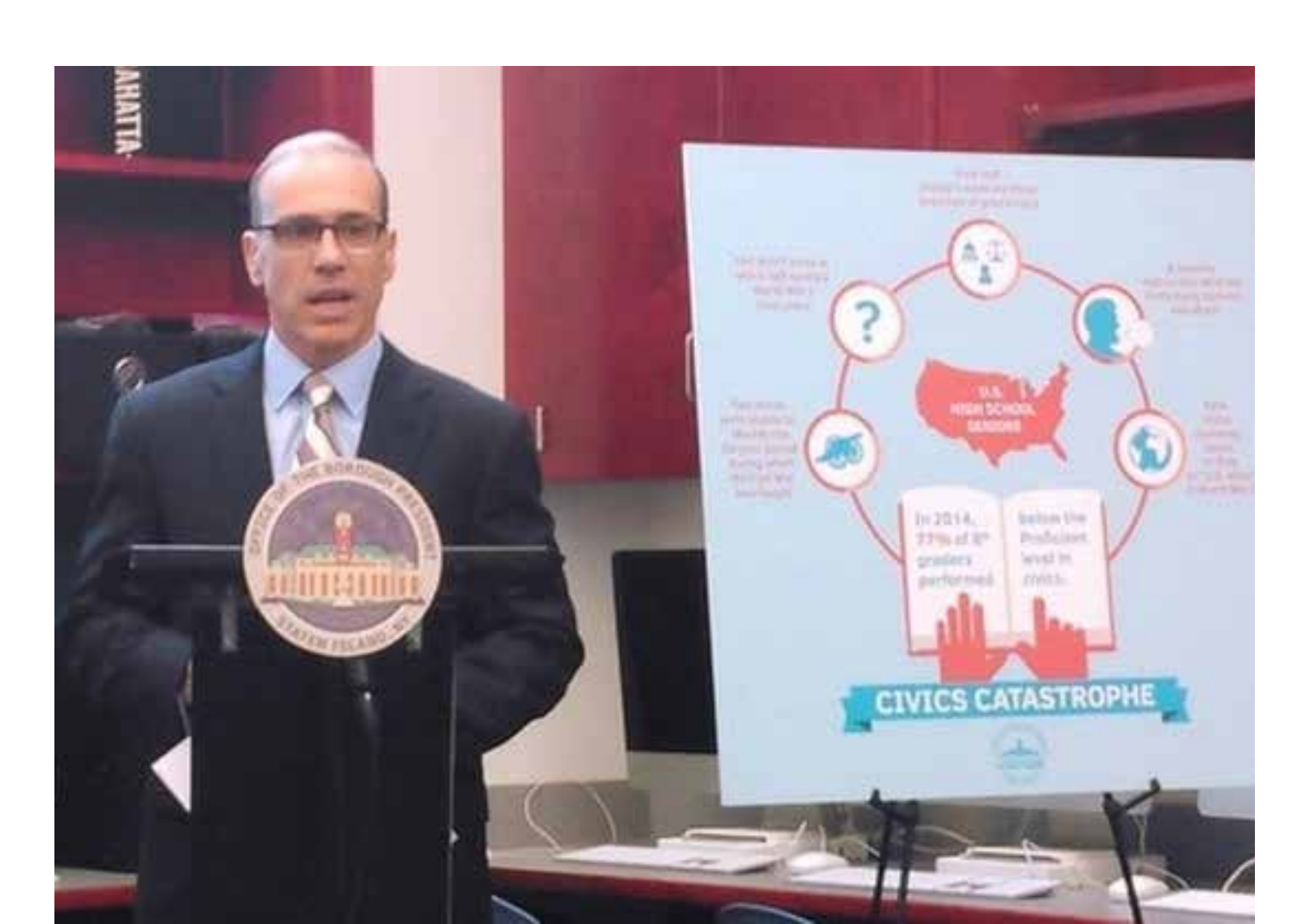
On April 26, 2017 BP Oddo announced an exciting partnership between our schools and iCivics at the Staten Island School of Civic Leadership.

One of the first ideas the team worked on was a transformative new policy aimed at restoring civics education on Staten Island. Our office partnered with iCivics, a not-for-profit organization that teaches students how government works by having them experience it directly through a series of interactive games. Every Staten Island public school Social Studies teacher is now armed with new evidencebased digital tools—free online games rather than outdated textbooks—to bring civics to life in the classroom and beyond. At a time when over 50% of high school students nationwide are unable to name all three branches of the federal government, Staten Island students will be poised to take the lead as informed, engaged, and committed members of our community.