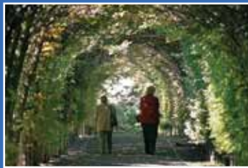
Miles of Trails